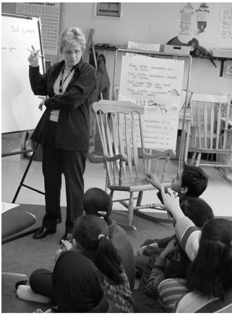
These students are working with their teacher to create a