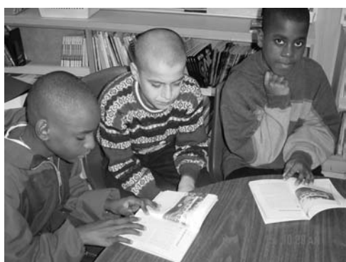
Guided reading enables students to draw meaning from text that is beyond their independent reading level.