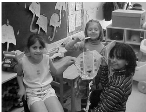
As students display the kite they made, each has an opportunity to talk about their creation and how they made it.