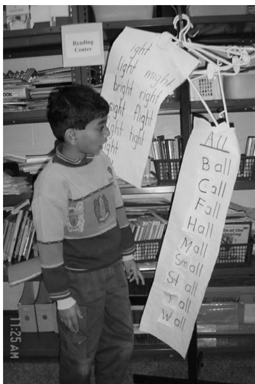
Recognizing rhyme is an important aspect of phonemic awareness.

Ask students to listen as you say each word while pointing to an appropriate picture. Be sure to pronounce each word in the pair with exactly the same intonation: the two should sound identical