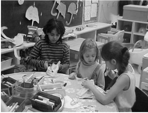
Making a kite provides beginning language learners with opportunities to learn to use new vocabulary and practice language forms.