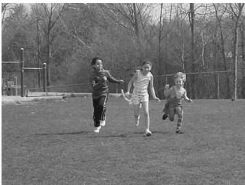
What better way to test a kite than to try flying it?