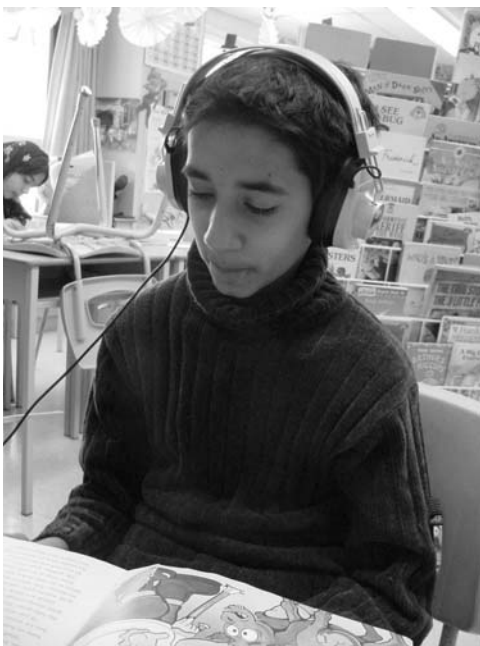
As students read along with a story on tape, they can repeat sections as necessary.

For beginners, avoid distractions such as sound effects. For students beyond the beginning stage, you might ask high school drama students